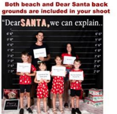
Both beach and Dear Santa back grounds are included in your shoot

Families of 7 or more will need to book a double session if wanting multiple poses due to time limits