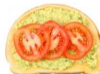
Avocado and tomato on toast