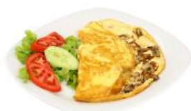
Mushroom and spinach omelette

Try these simple ideas to eat more veggies at the start of the day!