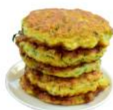
Corn and zucchini fritter