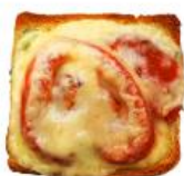
Tomato and melted cheese on toast