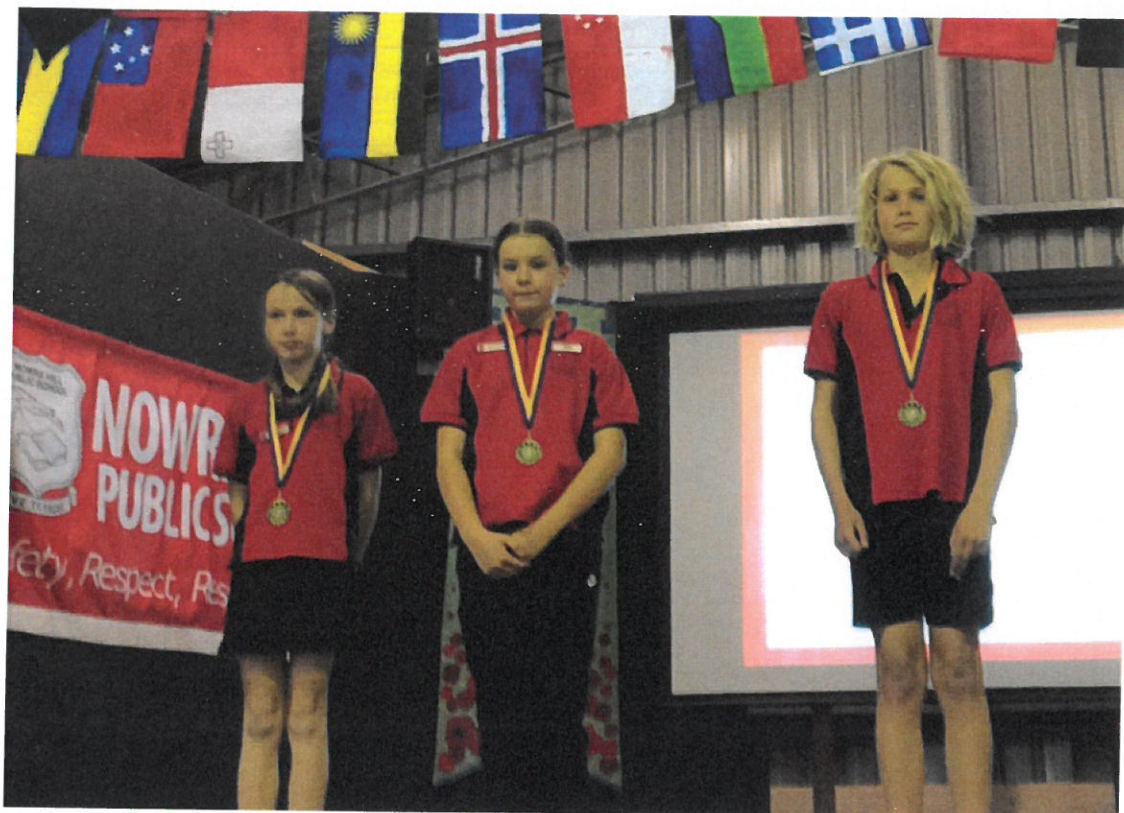
FISST Swimming Carnival Age Champions