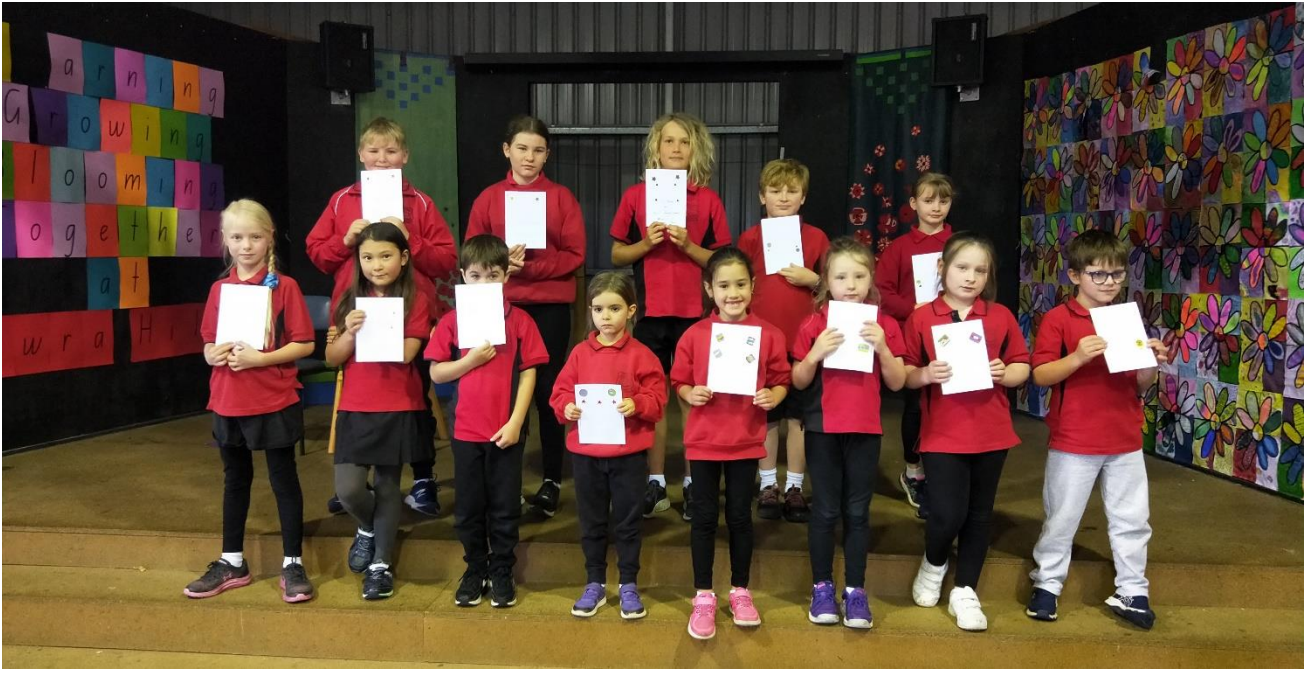
Merit and Principal Awards