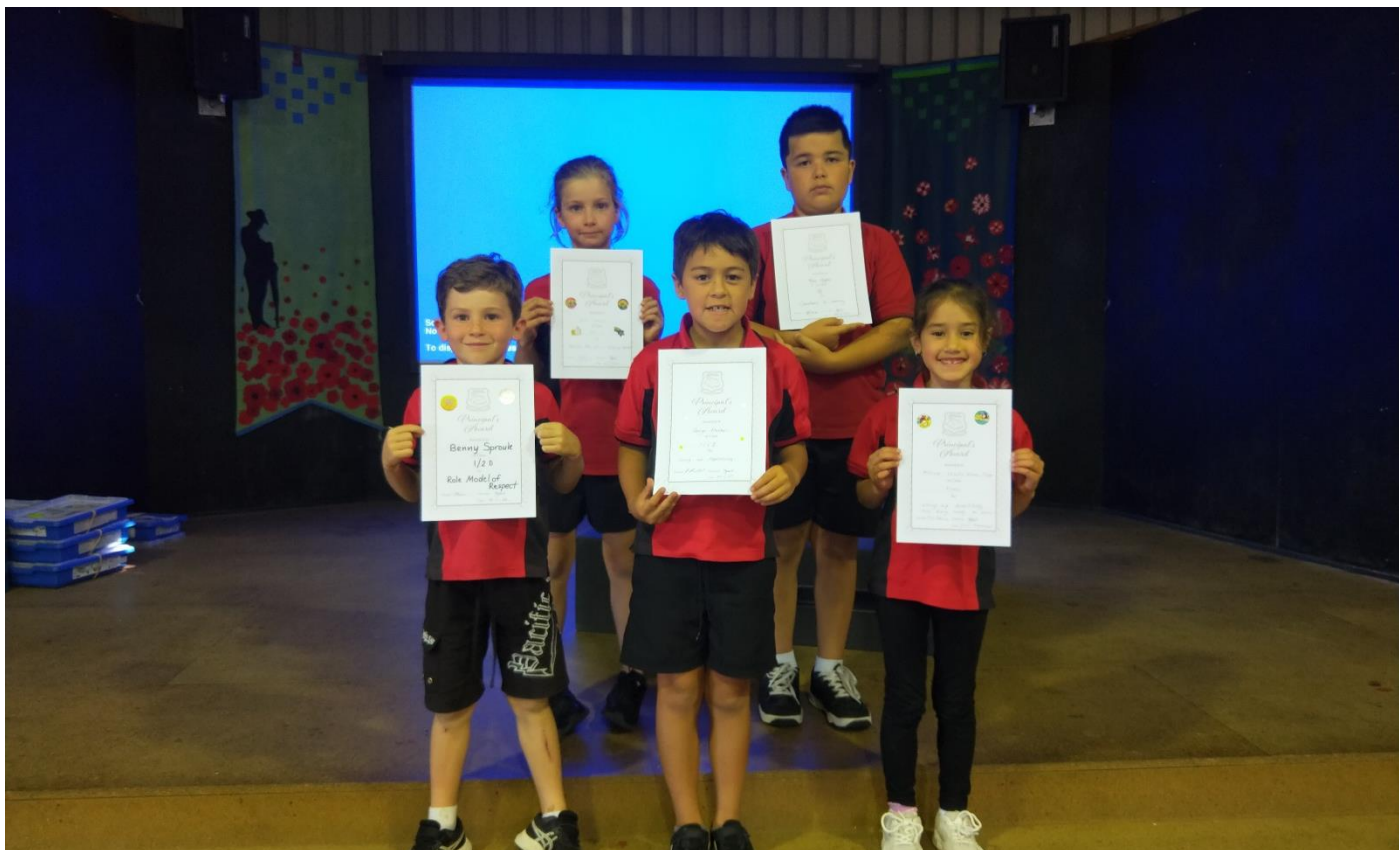
Principal and Merit Award