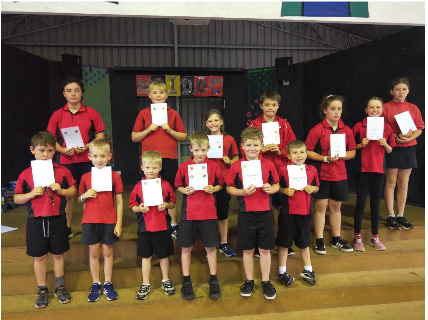
Merit Award and Principal Award