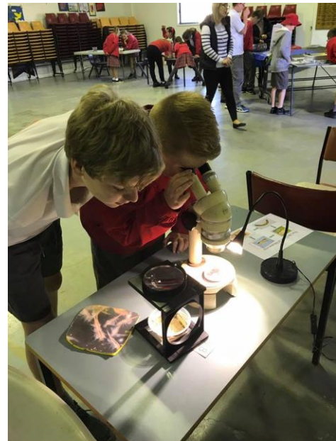
Science Viva – Mini Beasts