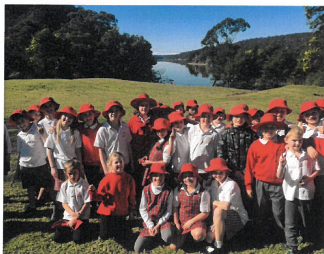
Bundanon Excursion - Yrs 3/4