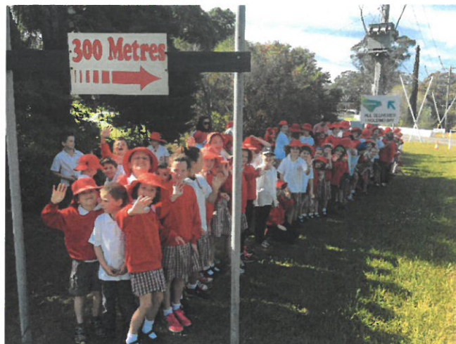
Students Waving to the MS Riders

Due to the Grandparents Day BBQ, there will be NO canteen this Wednesday.